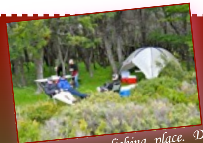
Base camp at a fishing place. Dry place and superb lunch full of comfort and fun.

We own - rent over 28,000 acres with many private access waters that will aloud you to fish totally alone in dream and solitude places, full of untouched fish.